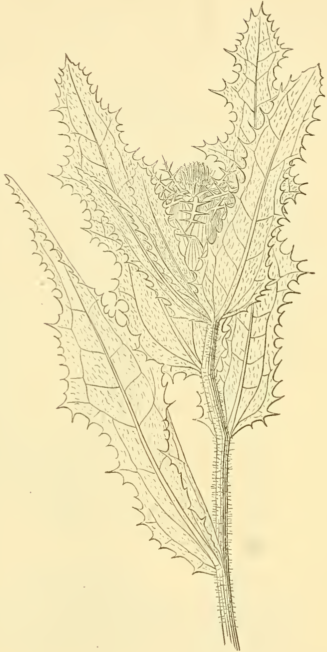
FIG. 23.—Blessed thistle ( Cnicus benedictus L.).

Yarrow is a stimulant tonic, acts upon the bladder, and checks excessive discharges.