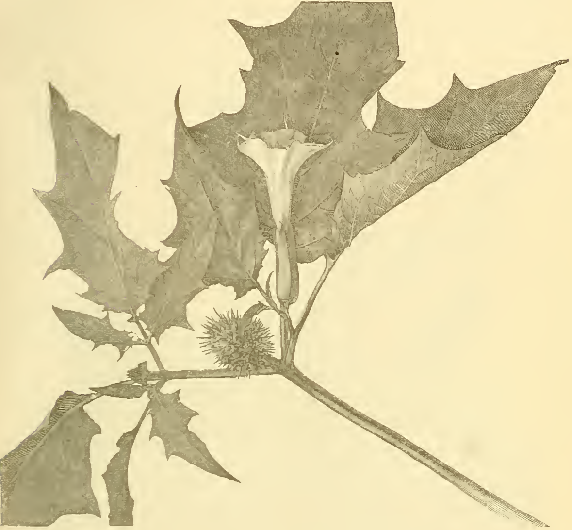
FIG. 27.—Leaves, flower, and capsules of jimson weed.

The purple thorn-apple, technically known as Datura tatula , is very similar to the jimson weed, possesses the same properties, and is dis-