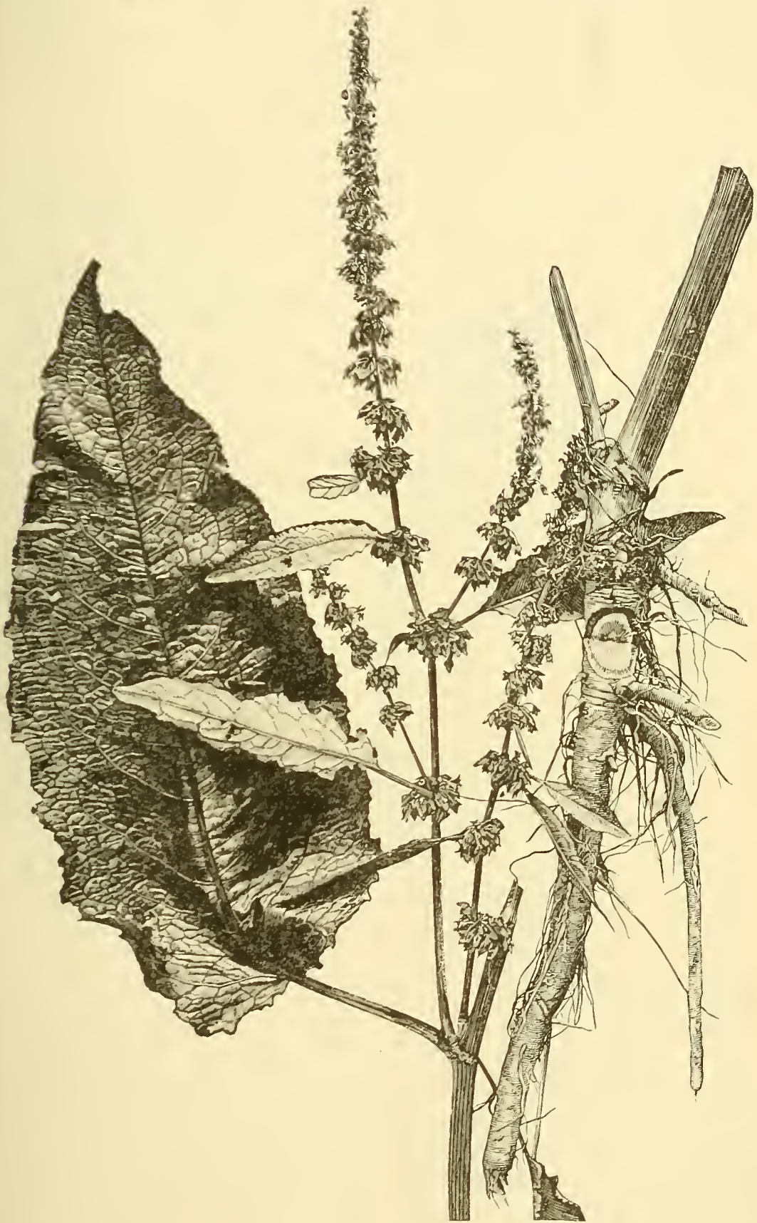
FIG. 7.—Leaf, fruiting spike, and root of broad-leaved dock.

the docks here mentioned, the three inner divisions of the calyx (outer covering of flower) in fruiting form a kind of triangular nut, like the