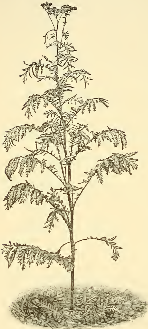
FIG. 16.—Tansy ( Tanacetum vulgare L.).

Tansy is employed in derangements of women, and has stimulant and tonic properties. It is also used for expelling worms. This drug is poisonous and has been known to produce fatal results.