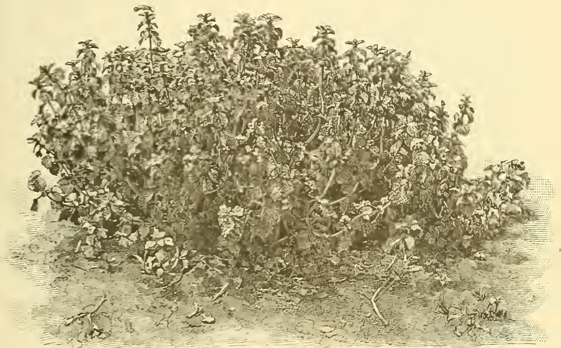
FIG. 21.—Hoarhound ( Marrubium vulgare L.).

Hoarhound is a bushy, branching herb, with fibrous roots sending up numerous woolly stems about 1 to 3 feet high, rounded below and