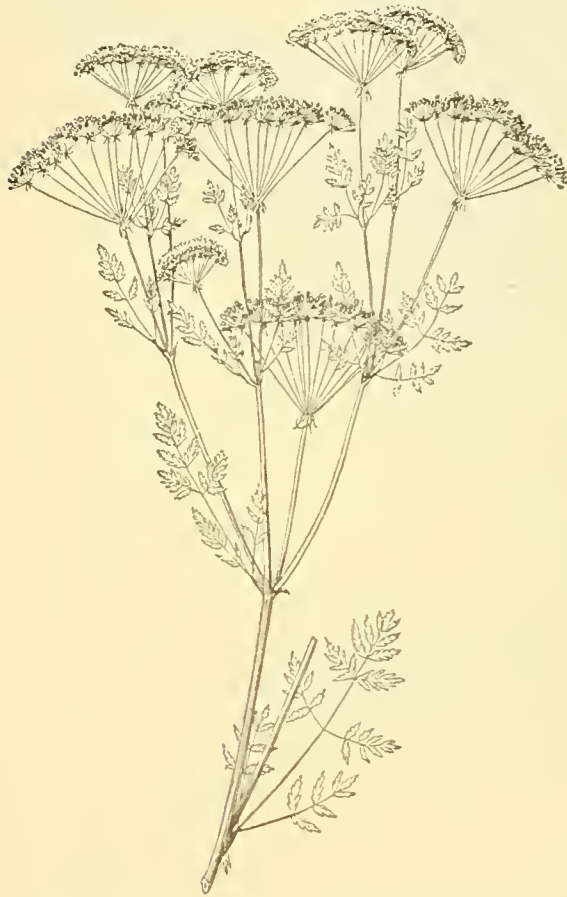
FIG. 28.—Poison hemlock ( Conium maculatum L.).

Poison hemlock belongs to the same family as the parsley, namely, the Apiaceæ. It is a biennial, about 2 to 6 feet in height, with a smooth, hollow stem dotted with purple, and large leaves very much