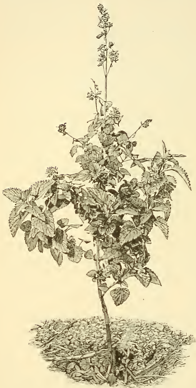
FIG. 20.—Catnip ( Nepeta cataria L.).

Hoarhound has been naturalized from Europe, and has escaped from gardens in this country, being found now rather abundantly in dry sandy or stony soil in waste places, pastures, fields, along roadsides, and near dwellings, from Maine to South Carolina, Texas, and westward to California and Oregon. It is very abundant in pastures in California, Oregon, and in limited areas in Indiana, Mis-