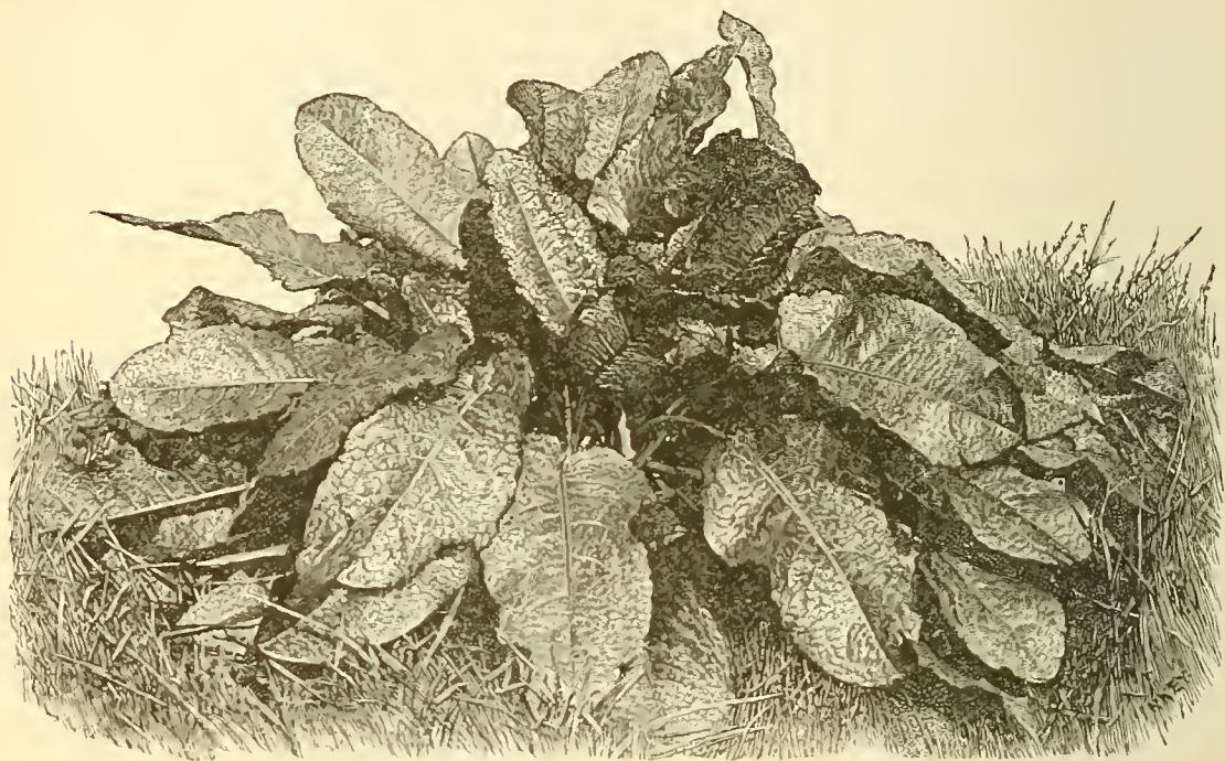
FIG. 6.—Broad-leaved dock ( Rumex obtusifolius L.). First year's growth.

Other common names. —Bitter dock, common dock, blunt-leaved dock, butter dock. (Fig. 6.)