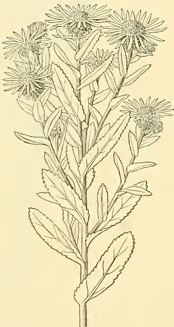
FIG. 18.—Scaly grindelia ( Grindelia squarrosa (Pursh) Dunal).

Description. —This species is very similar to the gum plant, with the exception that it is smaller and does not have the gummy appearance of the former. The slender, erect stems are from 1 to 2 feet high and somewhat sparingly branched near the top. The branches near the flower heads appear to be somewhat more reddish than in the species previously mentioned. In this species, also, the leaves are not borne on stalks, but are somewhat clasping at the base, and they are longer (about 2 inches long),