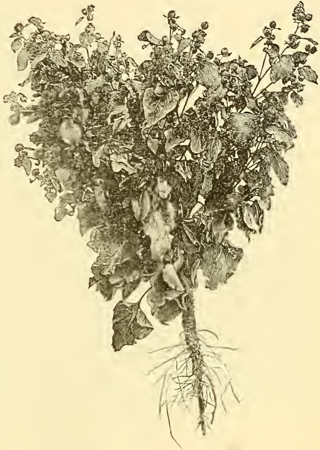
FIG. 1.—Burdock ( Arctium lappa L.). Flowering plant.

Description. —This is a coarse, unsightly biennial weed of the aster family (Asteraceæ), which produces during the first year of its growth only a rosette of large, thin leaves (fig. 2) and a long, tapering root having a diameter of from one-half to 1 inch. When full grown it measures from 3 to 7 feet high. The round, fleshy stem is branched, grooved, and hairy, with very large leaves, even in the early stages of the growth of the plant, the lower leaves often measuring 18 inches in length. The leaves are alternate, on long, solid, deeply furrowed leafstalks; thin, roundish or oval, but usually heart-shaped; with even, wavy, or toothed margins; smooth above, and