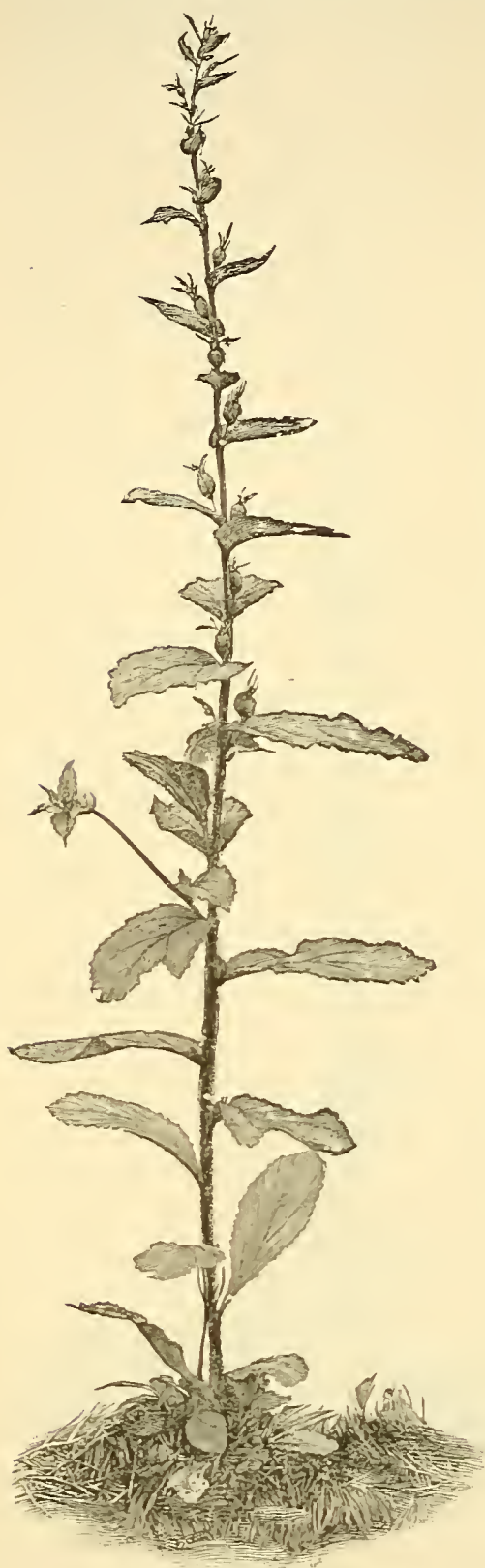
FIG. 15.—Lobelia ( Lobelia inflata L.).

Description. —The erect leafy stem of this annual herbaceous plant is from 1 to 3 feet high, from a fibrous root. It is simple and rough-hairy below, smooth above, and bears a few short branches. The entire plant contains an acrid milky juice. It belongs