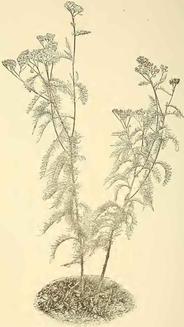
FIG. 24.—Yarrow ( Achillea millefolium L.).

Imports and prices. —This is an imported article, though not brought into the United States in large quantities. The price of achillea or yarrow ranges from 2 to 5 cents per pound.