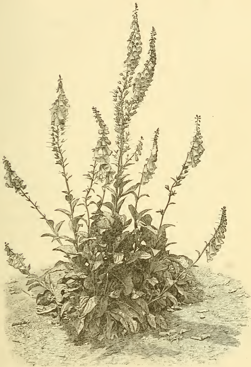
FIG. 13.—Foxglove ( Digitalis purpurea L.).

Range and habitat.—Foxglove was originally introduced into this country from Europe as an ornamental garden plant, but has now