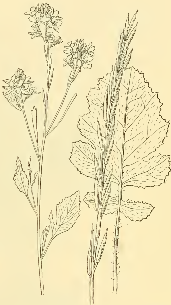
FIG. 30.—Black mustard ( Brassica nigra (L.) Koch).

Collection of seeds. —The tops may be pulled when most of the pods are nearly mature, but before they are ready to spring open. They should then be placed on a clean, dry floor or shelf, allowing the pods