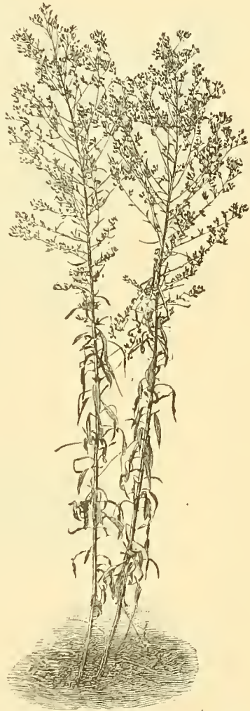
FIG. 25.—Canada fleabane ( Leptilon canadense (L.) Britton).

Description. —This well-known rank and ill-scented poisonous weed is an annual about 2 to 5 feet in height, and belongs to the potato family (Solanaceæ). Its yellowish-green stems are stout, leafy, and much forked. The leaves are large, 3 to 8 inches long, thin, smooth, pointed at the apex and usually narrowed at the base, irregularly waved and toothed, veiny, dark green on the upper surface and paler green beneath. The rather large, showy flowers are produced from May to September. They are white, funnel shaped,