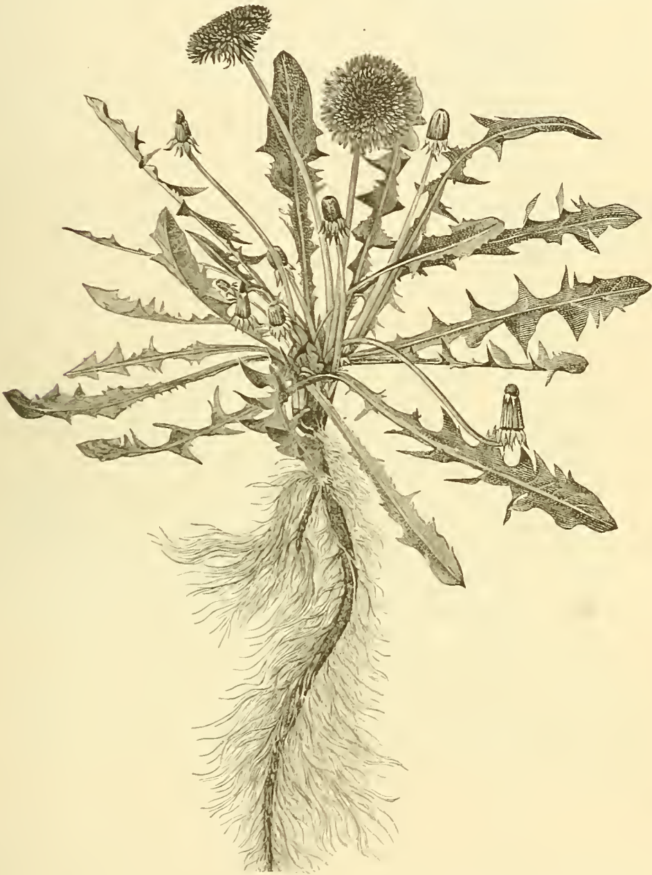
FIG. 3.—Dandelion ( Taraxacum taraxacum (L.) Karst). (An unusually fibrous root.)

Taraxacum taraxacum (L.) Karst. ( Taraxacum officinale Weber.)