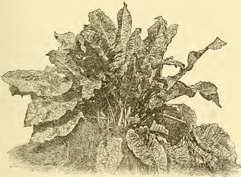
FIG. 5.—Yellow dock ( Rumex crispus L.). First year's growth.

Range and habitat. —The species most commonly employed in medicine is the yellow dock, a perennial introduced from Europe and