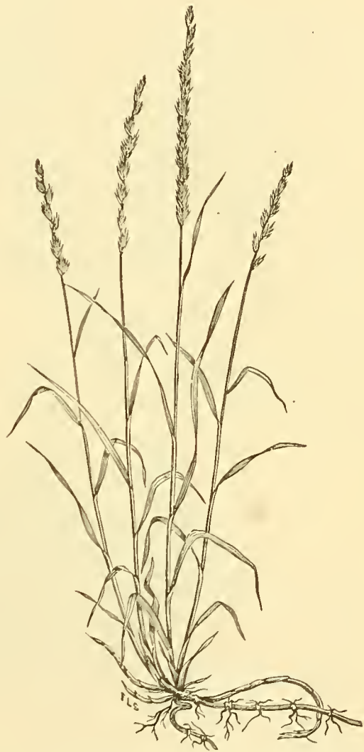
FIG. 9.—Couch grass ( Agropyron repens (L.) Beauv.).

Description. —This rather coarse grass produces several stems, 1 to 3 feet high, from a long, creeping, jointed rootstock, and bears densely flowered spike-like heads resembling those of rye or beardless wheat. The stems are round, smooth, thickened at the joints, and hollow, bearing from five to seven leaves. These have a long cleft sheath, and are rough on the upper surface. The heads or spikes are terminal, solitary, compressed, with two rows of spikelets on a wavy and flattened axis.