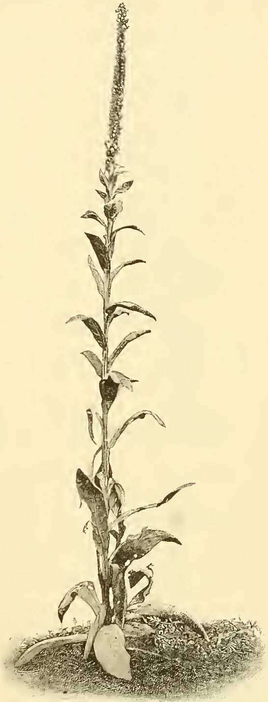
FIG. 14.—Mullein ( Verbascum thapsus L.).

It is very desirable to have the flowers retain their bright yellow color; they must therefore be thoroughly dried, and then kept free from moisture in well-stoppered bottles. They readily absorb moisture and