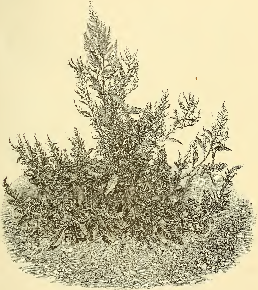
FIG. 29.—American wormseed ( Chenopodium ambrosioides L.).

Other common names. —Mexican tea, Spanish tea, Jerusalem tea, Jesuit tea, ambrosia. (Fig. 29.)