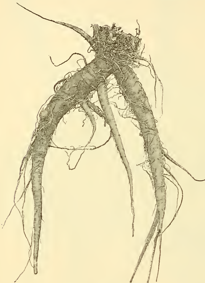
FIG. 8.—Yellow dock root.

Habitat and range. —As the common name indicates, this plant frequents swampy and wet places and banks of streams. It is found from Canada to New Jersey and Pennsylvania, and westward to Minnesota, Illinois, and Iowa.