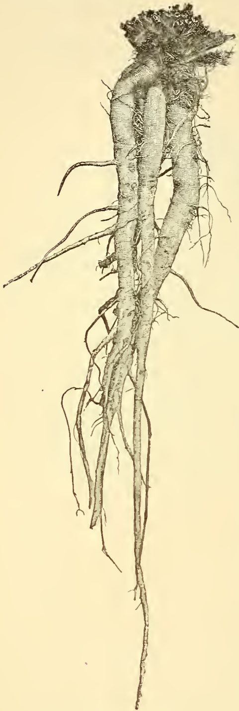
FIG. 4.—Dandelion root, 16 inches long.

lized parts of the world, and in this country is naturalized from Europe. With the exception of the South, it is very abundant throughout the United States in fields and waste places, and it is especially troublesome in lawns and meadows.