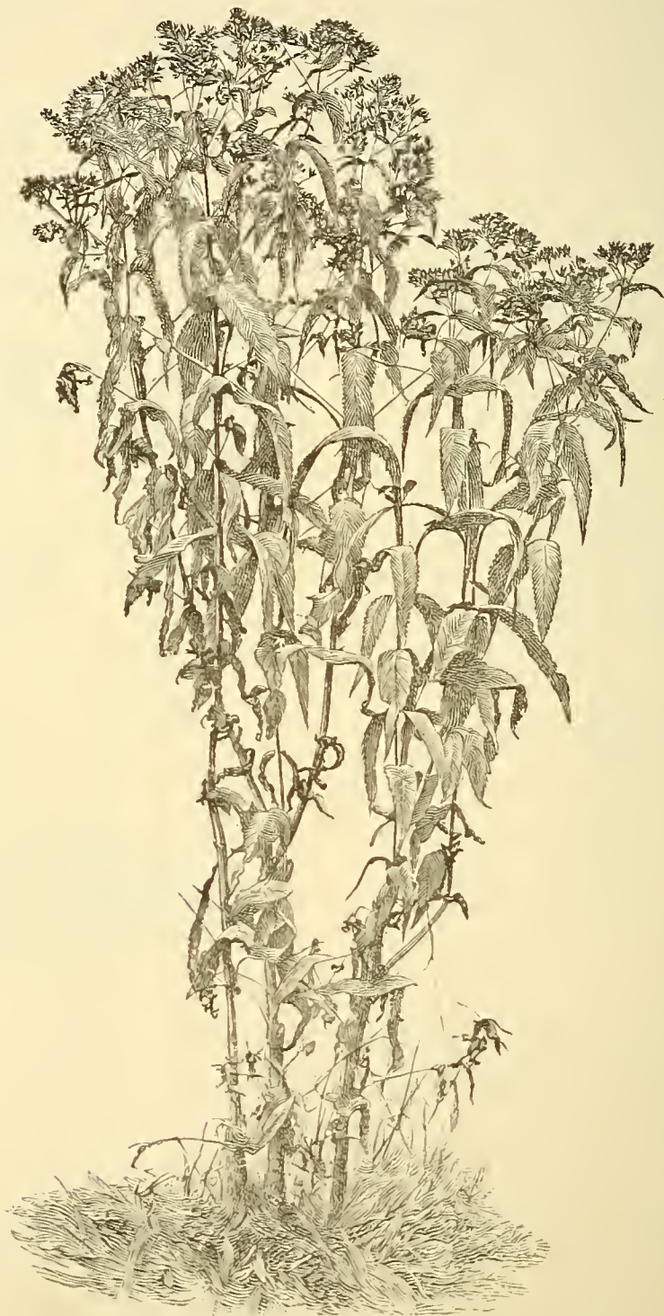
FIG. 19.—Boneset ( Eupatorium perfoliatum L.).

Other common names. —Thoroughwort, crosswort, wood boneset, teasel, ague-weed, feverwort, thorough-stem or thorough-wax, vege-