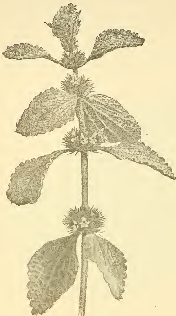
FIG. 22.—Hoarhound, flowering top.

Imports and prices. —A considerable quantity of marrubium or hoarhound is imported, about 125,000 pounds coming into this country annually. Three to 8 cents is the price paid per pound.