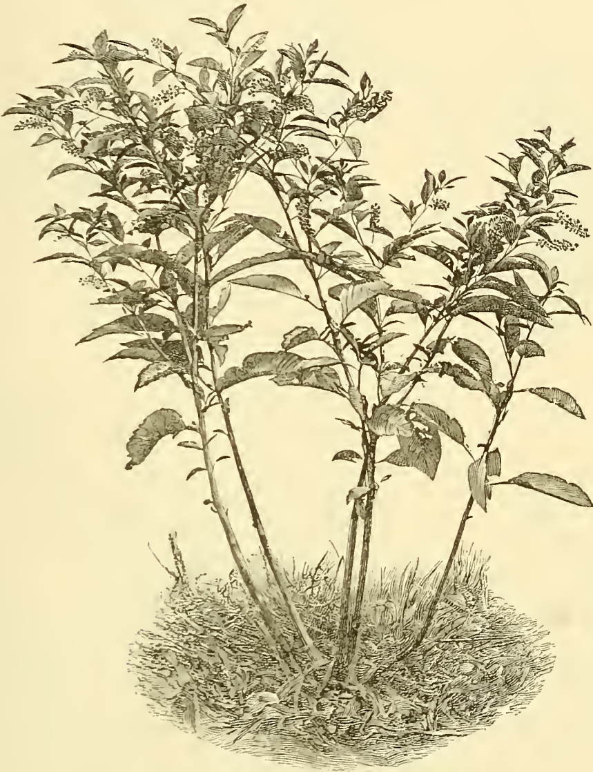
FIG. 10.—Pokeweed ( Phytolacca americana L.).

the stem, the pith will be seen to be divided into disk-shaped pieces, with hollow spaces between them. The leaves are ovate or ovate-oblong, acute at the apex, smooth, about 5 inches long and 2 to 3 inches wide, on short stems. The margins are without indentation. About July to September the long clusters of whitish flowers are produced, followed by the green berries, which upon ripening become a rich dark-purple color. The flower clusters are from 3 to 4 inches in length and