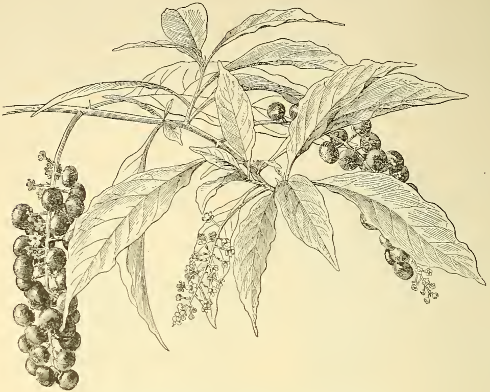
FIG. 11.—Pokeweed, flowering and fruiting branch.

The clusters of berries should be carefully dried in the shade. They are poisonous, have no odor, a sweetish taste at first, then acrid.