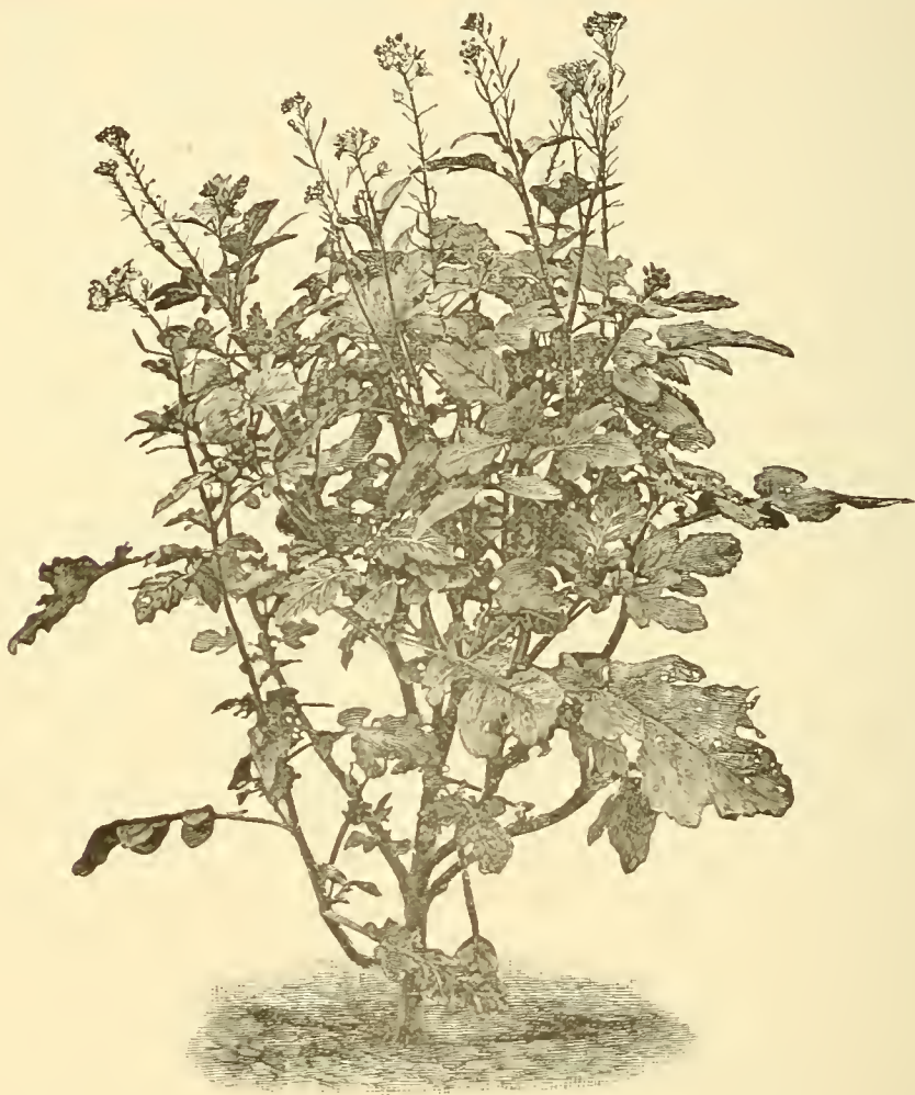
FIG. 31.—White mustard ( Sinapis alba L.).

Range and habitat. —White mustard is a weed found in cultivated