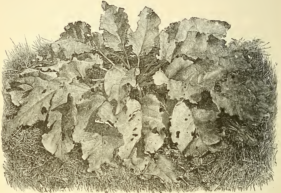
FIG. 2.—Burdock. First year's growth.

Parts used. —The root alone is recognized in the United States Pharmacopœia, but there is a limited demand for burdock seed, and the