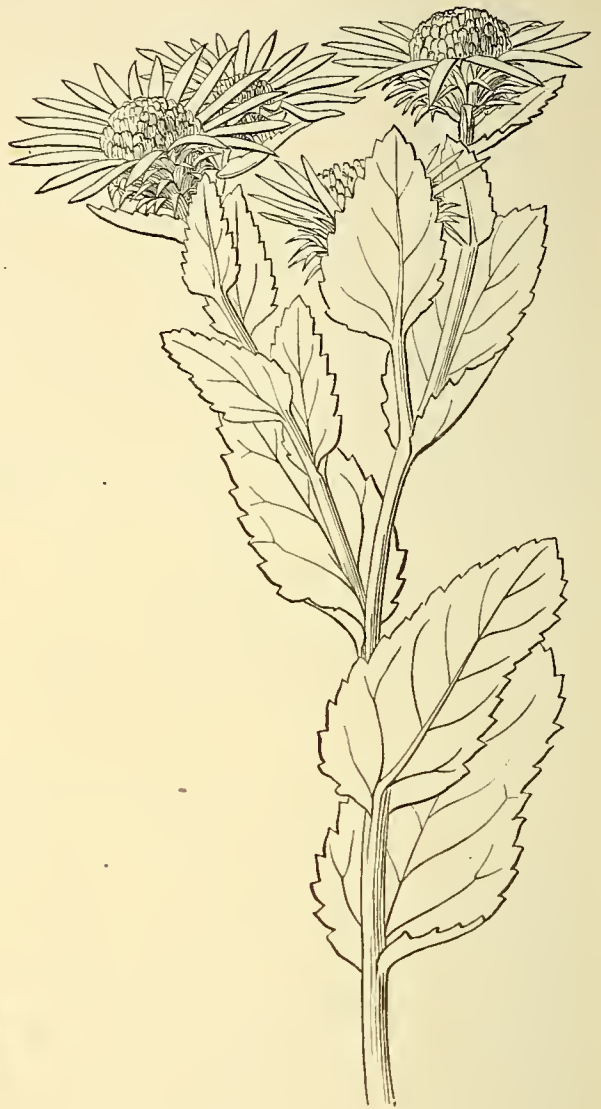
FIG. 17.—Gum plant ( Grindelia robusta Nutt.).

Imports and prices. —About 30,000 pounds of tanacetum or tansy are imported annually. The price paid per pound ranges from 3 to 6 cents.