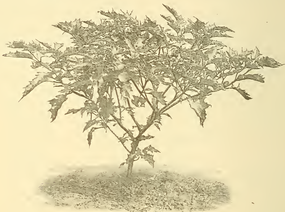
FIG. 26.—Jimson weed ( Datura stramonium L.).

Parts used. —Both the leaves and seeds are medicinal. The leaves are collected at the time of flowering, the entire plant being cut or pulled up and the leaves stripped and dried in the shade. The unpleasant narcotic odor diminishes upon drying. The leaves are poisonous, cause dilation of the pupil of the eye, and are used principally in asthma.