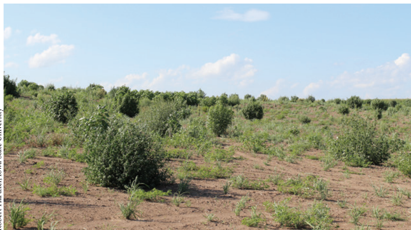
Palmer amaranth in conservation planting.

amaranth. If using herbicides after mowing, delay the applications for two weeks to allow new growth to develop. Some Palmer amaranth populations have shown resistance to glyphosate. Also consider mechanical removal and/or spot burning.