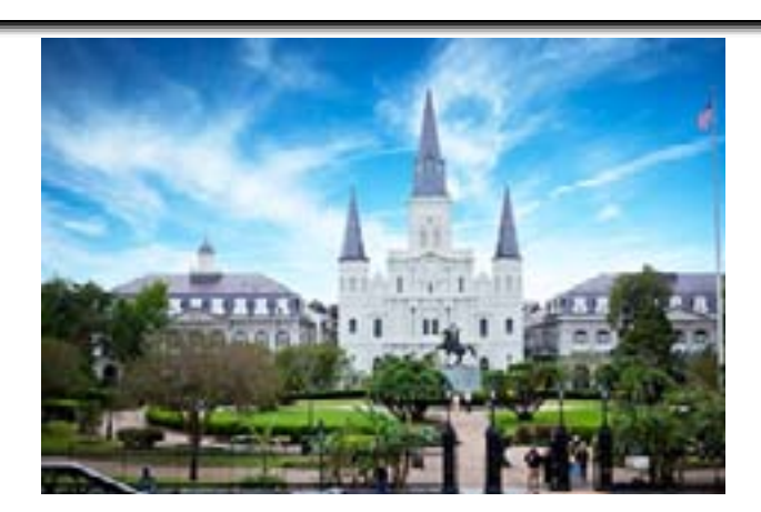
Sheraton New Orleans Hotel

Hotel Information: 500 Canal Street New Orleans, LA 70130 504,525,2500