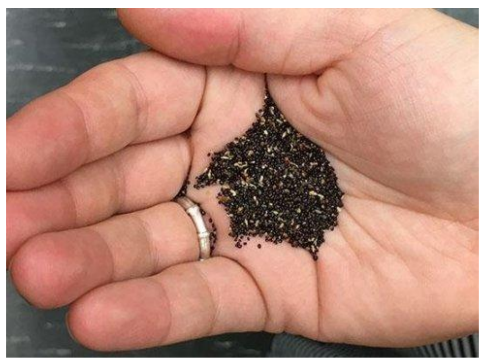
PHOTO: The new genetic test can detect a single Palmer amaranth seed among 99+ seeds of close relatives.

"I've had seed growers call me," says Pat Tranel, molecular weed scientist in the crop sciences department at the University of Illinois. "Their businesses are up in the air because of this. Unless they have a way to certify their product is Palmer-free, they can't sell it."